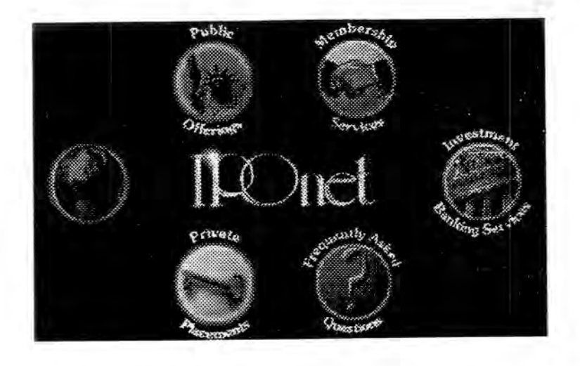
Public Offerings... Membership Services...Private Placements... Frequently Asked Questions...Investment Banker Services